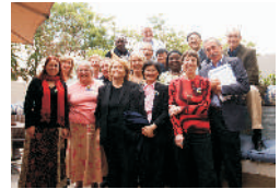
The VAC members group photo

The recent WHO-UNAIDS Vaccine Advisory Committee (VAC) meeting was held in Johannesburg. VAC provides advice to WHO and UNAIDS on activities related to the development and evaluation of HIV vaccines. VAC meet several times a year and at each meeting an open scientific briefing session is organised prior to the meeting. The meeting is traditionally held in a country directly involved in HIV vaccine research and clinical trials; and therefore the briefing session is an excellent opportunity for VAC members to meet and share their expertise with local investigators.