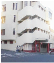
Esselen Street Clinic